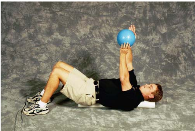
73 B: Finish

Purpose: Improve scapular stabilization.