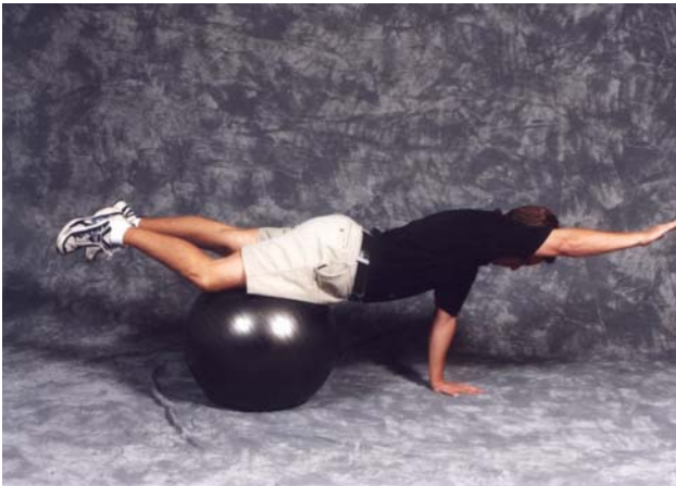
124 D: Advanced Finish

Purpose: To increase core and shoulder girdle strength.